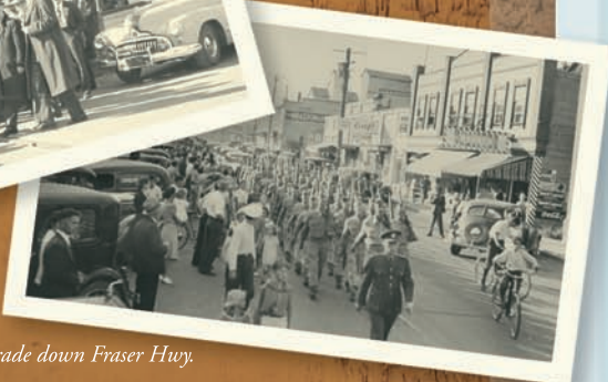
Historical photos courtesy of the Langley Centennial Museum

To book a tour for 2 – 10 people, please call 604-539-0133