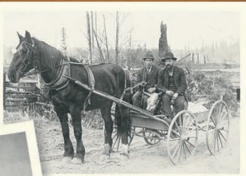
Old Yale Road

Our tour winds up at the end of the one-way section of Fraser Highway. A landmark in Langley, "The Old Country Inn" stood for twenty-five years serving Austrian cuisine in a fine dining atmosphere.