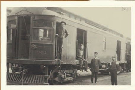
The first Electric train