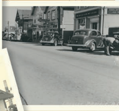
Looking East, Fraser Hwy.