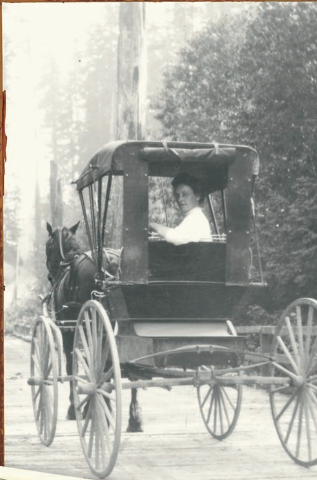
Woman & carriage at Portage Park

The City of Langley has a very diverse downtown with a strong sense of history. We want to share that history with you.